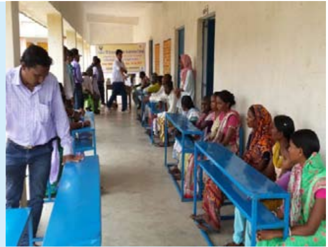
Seraikella - Kharswan