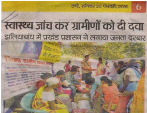
ICF in Janata Darbar Gumla, Jharkhand