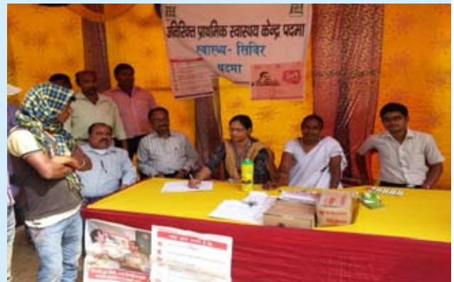
Janata Darbar Hazaribagh