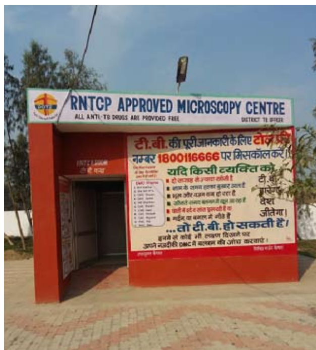
TB Unit Siwan, Kaithal District, Haryana