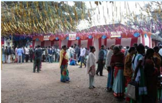
ICF Camp at Goikera, West Singhbhum